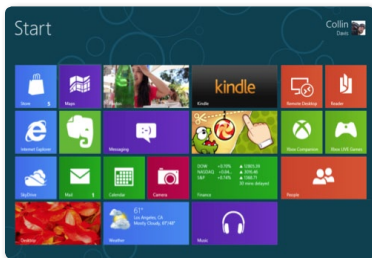
Metro (touch screen)